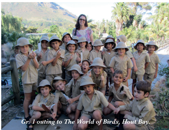
Gr. 1 outing to The World of Birds, Hout Bay.

enjoyable term with a party theme where the boys were involved in many party games and learnt valuable skills on how to win and lose like gentlemen. We had a pirate-themed dress up party where the boys enjoyed participating in game stations with gold coin rewards. It was a wonderful day and fortunately no-one had to walk the plank!