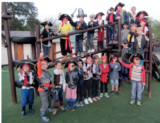
Party time for Gr. 1H - The boys dressed as pirates!

The boys always return from holiday keen to catch up with their friends. We kicked off the term sharing and writing about our holiday news; a relatively new concept for the Grade 1s as for the first time they were now able to form and write simple sentences. The second term looked to be a long fun-filled term, and we were all the more motivated as we looked forward to a mid-term holiday, courtesy of Freedom Day and Workers' Day! Our first theme work for the term was on birds, and we began this with a lovely outing to The World of Birds in Hout Bay. The boys were able to interact with the talking parrots, monkeys, tortoises and the little wallaby, as well as share their own knowledge and learn new facts about the wonderful variety of birds on display. We then moved on to learn about farm animals and then