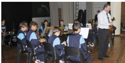
Tour Music Concert.