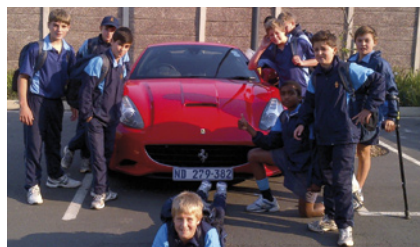
Approval from the Tour boys!