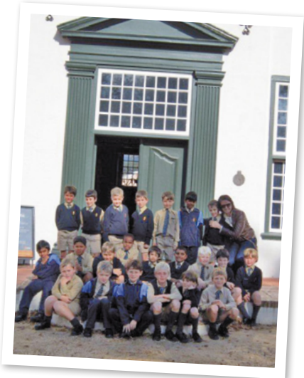
Groot Constantia Outing – Grade 2F.

Our visit to Groot Constantia introduced the boys to the diversity of cultures that make up our 'Rainbow Nation,' with particular emphasis on the cultural influences on the architecture of our country. They were also taught about the traditional dwellings of some of our indigenous people. In art they made clay models of a Cape Dutch Home and with the help