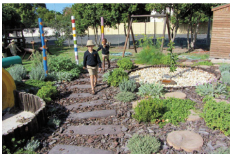
Kian Aneca-Human and Bafokeng Lehloeny exploring in the sensory garden.

The rest of our themes this term have allowed us to keep the boys learning 'real' in different ways. Our new sensory garden is a wonderful addition, and has provided a multi-purpose environment for the boys' investigations. The boys have explored the smells and textures of the different plants and examined the patterns that can be found in nature. They observed which plants change with the seasons and have discovered tiny animals that have made their home in the lush growth. When learning about reptiles we even had our local dwarf chameleons make their appearance. When we were investigating dinosaurs we took the boys down