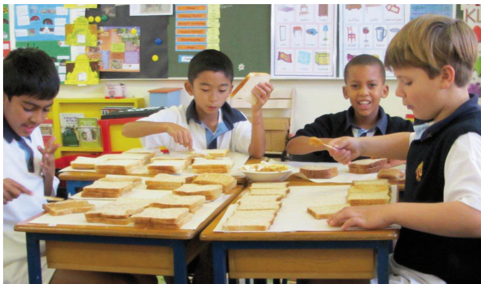
Making sandwiches for Atholl Primary.

of the students, created vibrant pictures of Ndebele houses using crayon and dye.