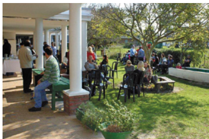
Parents enjoying tea in the garden