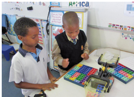
Discovering Mathematics with Numicon.