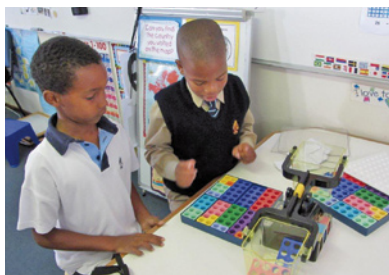
Discovering Mathematics with Numicon