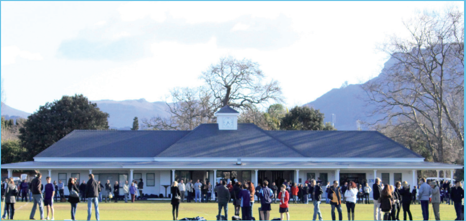
Rick Skeeles Pavilion – opened on 4 August 2011