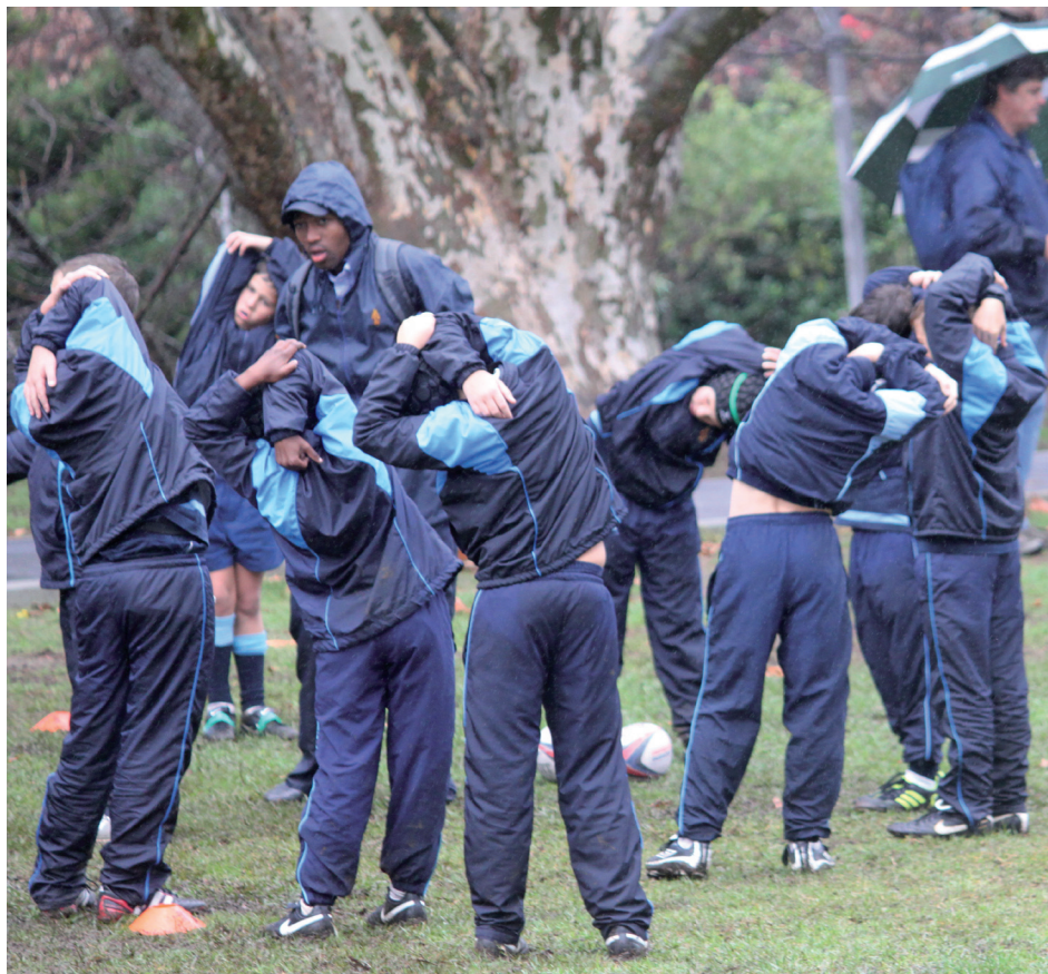
U10A warms up in the rain

The season started with construction taking place at the entrance to Lutgensvale of the Rick Skeeles Pavilion. We started our 150th year of rugby with our normal pre-season coaches' seminar. Having looked at a number of different rugby models around the world, most notably the Australian system, we 'tweaked' ours slightly. We have made a conscious effort to work harder at the generic basics of the game, passing, rucking, catching and tackling whilst not losing focus on the other important aspects of the game. Once a Prep schoolboy is able to master the four basic areas he is well set for all the other intricacies of the game. We hosted our parents for a rugby evening in the Heatlie Pavilion where we reminded all of the rugby ethos at Bishops, the importance of the game and the value and role that they play in the development of their boy's love of the game. Bishops Prep continues playing the Bishops style, where the emphasis is on the ball beating the man; where guile and skill are praised. Long may this continue.