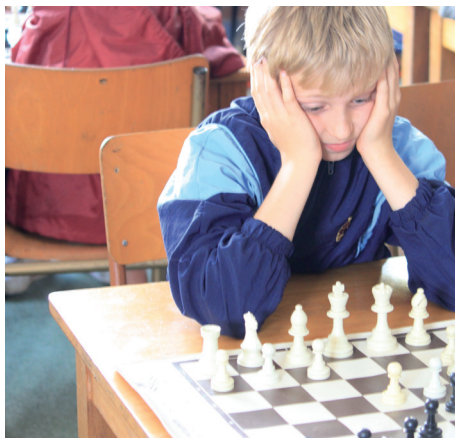
Concentrating hard at Eikestad