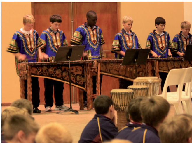
Prep Marimba Band