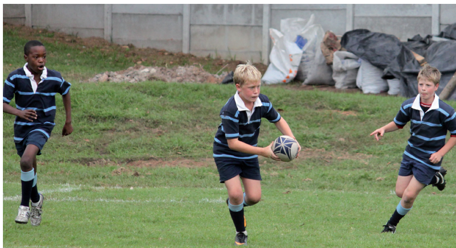
U11B on the charge