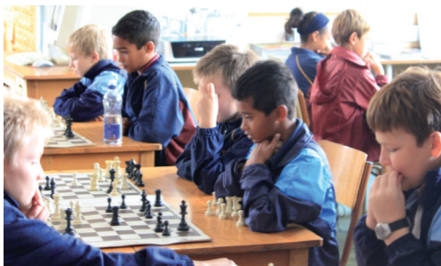
Chess vs Eikestad