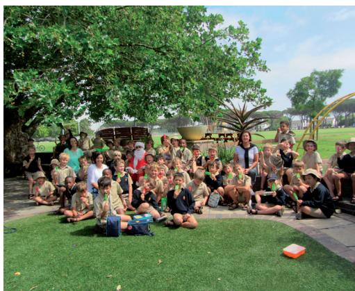
Grade IV enjoying their ice creams after a visit from Father Christmas.

opportunity to role-play a variety of jobs including being a teller at the bank; a shopkeeper; a vet's assistant and broadcasting the weather on television. We played 'Shop, Shop' and the boys learnt about our currency and how to give change. The highlight was our Trading Day when each child had to bring items that they had made to sell. They set up their stalls; advertised their goods and had to market their items to the rest of the boys in the grade. Then the shopping began – it was a fun-filled morning and a great deal was learnt in the process.