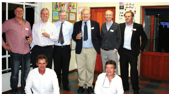
Members of the 1962 class celebrating the Pre Prep's 50th Jubilee

A highlight of this year was the production of “Guys and Dolls” with a large cast and crew, a huge staff team and girls from five neighbouring schools. Fred Astaire said, “A musical is a celebration of life” and “Guys and Dolls” certainly was.