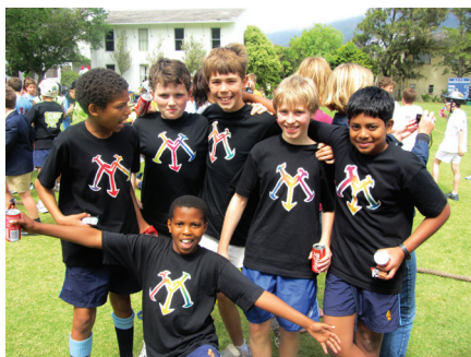
The Winning T-Shirt!