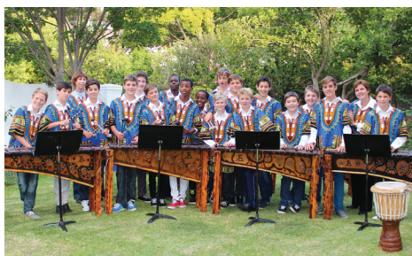
The Marimba Band!