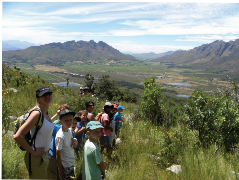
Mom's and Son's Camp!

Thank you very much to all club members who sold cake & candy to raise R2200 for animal charities in Cape Town. Your commitment to this worthy cause is most commendable.