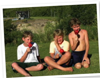
Mom's and Son's Camp!