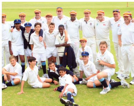
u13A vs Blackbatts!