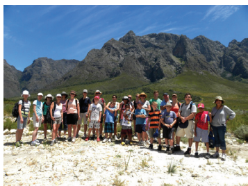
Mom's and Son's Camp!