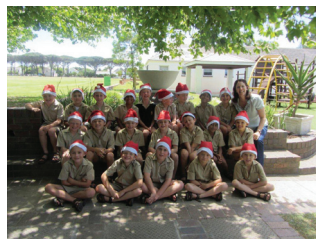
Grade 1s celebrating the coming of Christmas.

the correct change, at which the money was promptly returned with the comment, "Just take it then!" It was a fabulous experience for all of the boys and a great deal was learnt. We went on an outing to Kiddies Campus and there the boys experienced a wide variety of working environments such as the bank, the supermarket, the veterinary clinic and a T.V. studio. It was lovely to see how the boys interacted in small groups; trying out their positions in the companies. Our other outing was to Kirstenbosch and we encouraged the parents to join us on this one. We followed the Monty Mongoose Trail