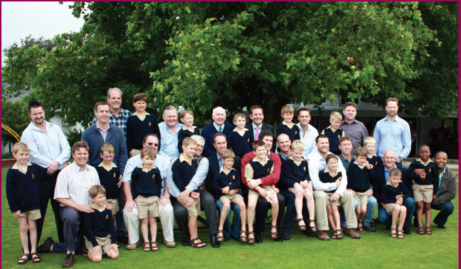
Bishops Pre Prep Celebrates 50 Years: OD Fathers and Sons