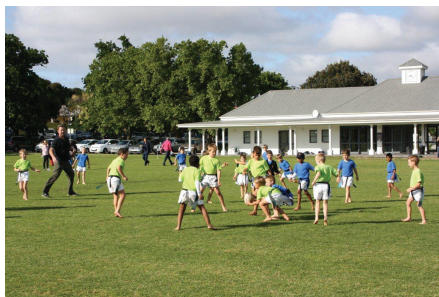
Tag Team Tournament on Lutgensvale!