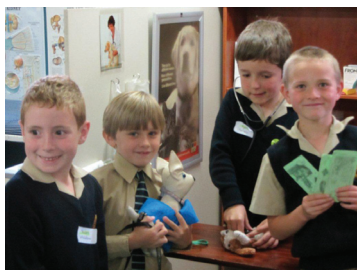
Kiddies Campus: The boys have fun at the Veterinary Clinic.