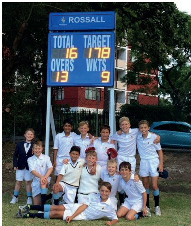
First game with the new digital scoreboard in use, U11A vs Kirstenhof.

scraped over the line with only a few wickets left. They got their revenge when we somehow made a hash of saving the match and had a few silly dismissals including a 'Donald/Klusener' run out in the last over. Our boys then spun a web around the Rondebosch batsmen on a dry,