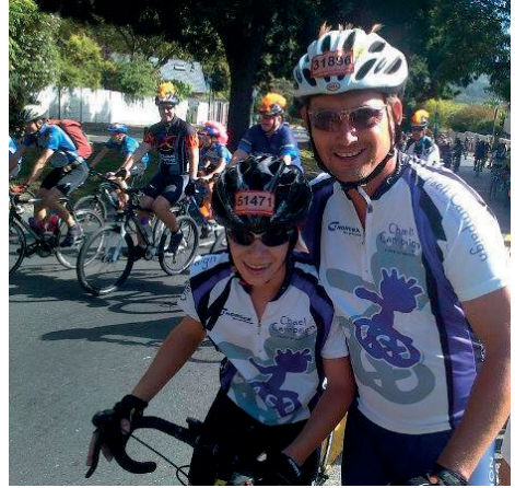
The Argus 2014: Chaeli Riders