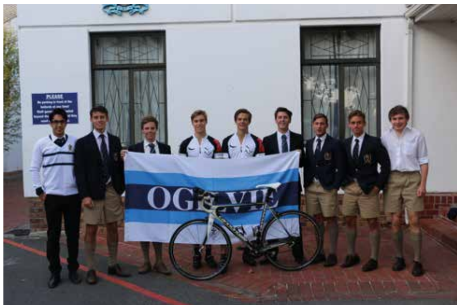
The Rhino cyclists ready to embark on their five-day journey.