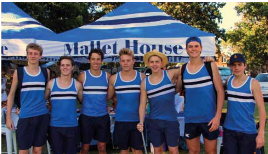
Mallett Matrics: Sports Day