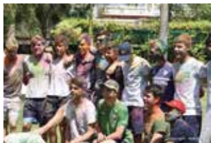
Celebrating Holi (the colours festival) in Agra