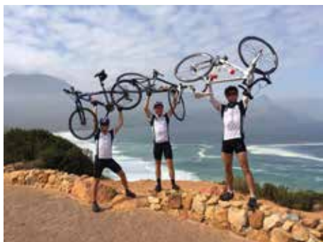
Koelbaai, just after Gordon's Bay, still going strong