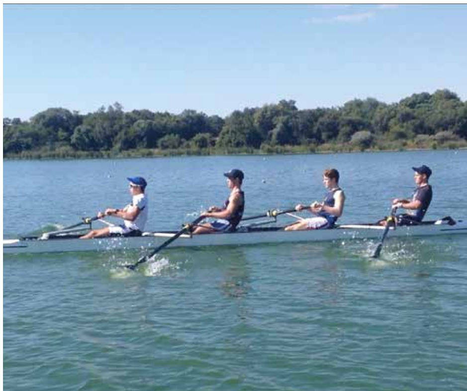
The new Junior SA 4-