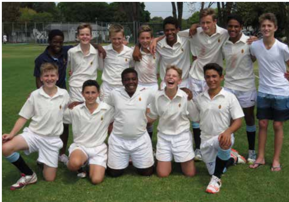
U14B celebrations after the victory against Bosch 5-3-16

next two matches, however. At home against Wynberg, a promising start was squandered in spectacular style as the opposition spinners claimed our last nine batters for just 25 runs; needless to say, it did not take long for Wynberg to knock off the total they needed to ensure victory. A few days later we travelled out to Bellville High to take on their highly-rated A-team; here we came up against a few chaps in top form who rattled up a daunting total with the bat before putting us under early pressure with the ball. On this occasion, our young men stuck to their guns and jealously guarded their wickets, but we still ended up quite a few runs shy in the end. This proved to be the turning point of the summer, for things picked up immediately hereafter, even though our next game involved a challenging trip out to the winelands to take on Paarl Boys. After a quiet