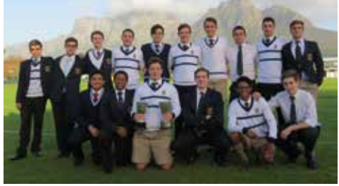
Academic Cup Winners and Best Grade 2015