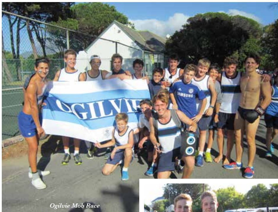
Ogilvie Mob Race