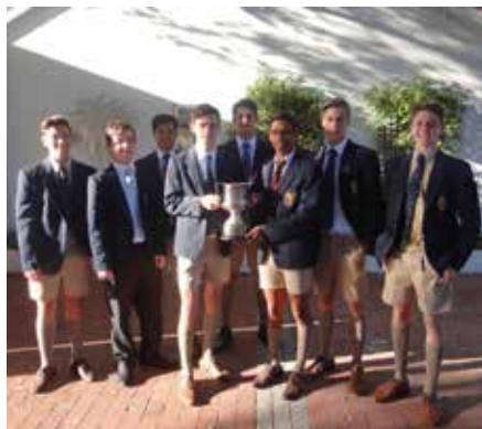
Senior Basketball Champs