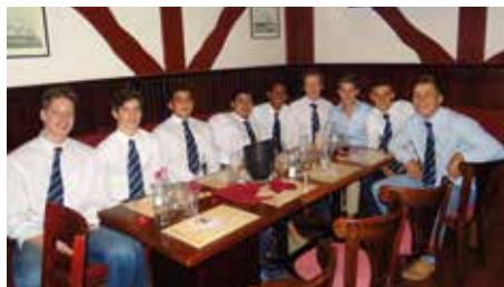
Birt Matrics enjoying dinner at Nelson's Eye Restaurant