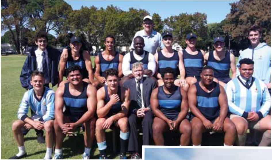
Senior tug-of-war champions