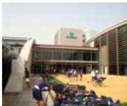
A visit to the ICC Academy in Dubai