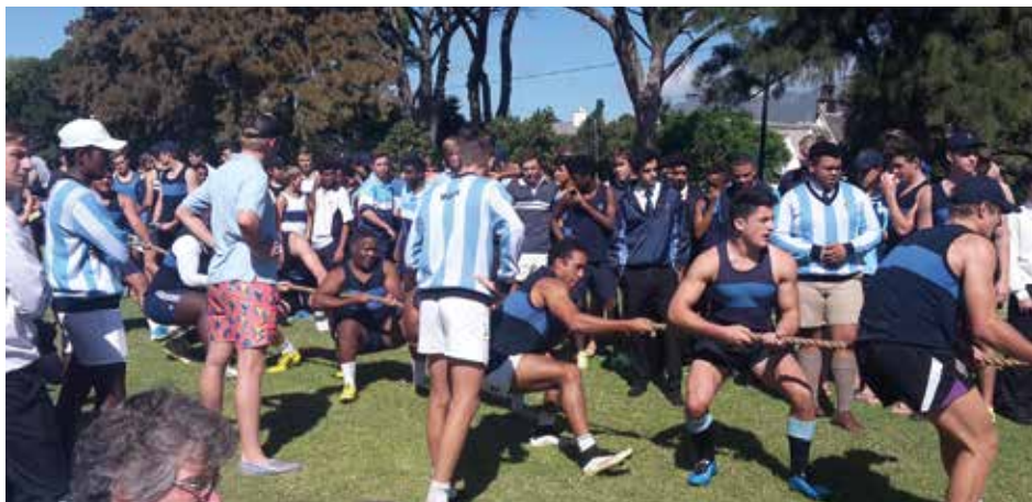
Top House seniors battling for glory

The year started off with the Top House Cabaret adding to an already overloaded first term calendar. Our Cabaret was once again a smash hit among parents and visitors who expressed their amazement at the quality of the show and the talent of our boys. The Cabaret remains a great way to set the tone for the year and bond new and old members of the House.