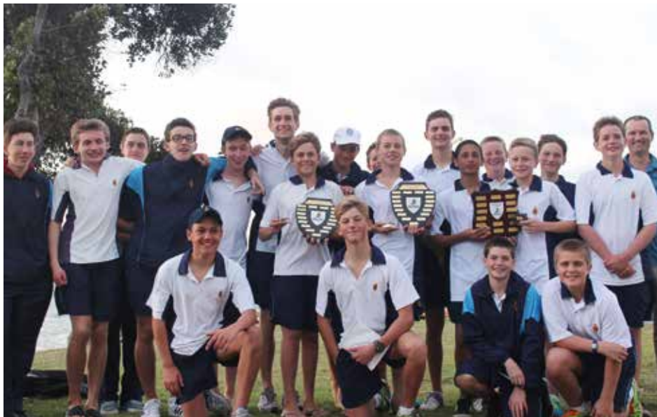
Bishops Sailing Squad