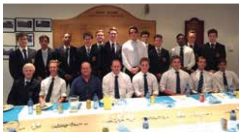
Gray Matric Dinner