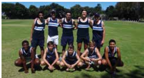
Inter Tutor Group soccer winners, The Rutter Rats