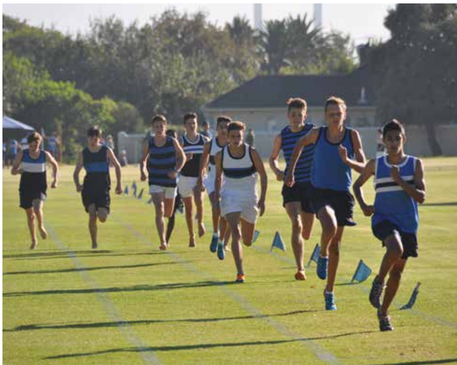
Sports Day 800m U16