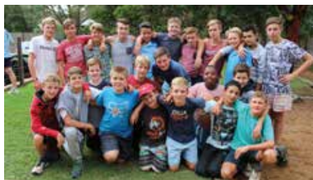
Grade 8s on camp