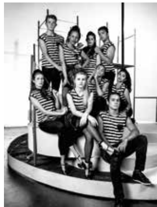
Jail House Rockers and Rockettes