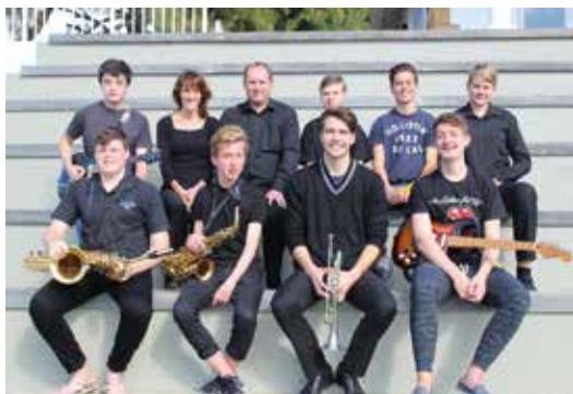
All Shook Up Band