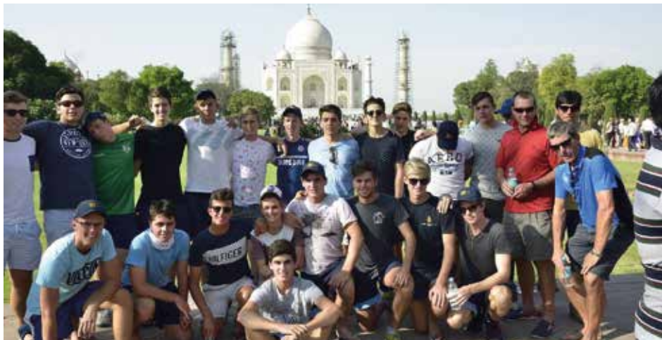
Bishops touring party at the world famous Taj Mahal, Agra

too, as the last ODI played at this stadium was between SA and India in which Sachin Tendulkar scored his maiden double hundred in ODIs. After a short stay in Agra we set off for the city of Jaipur. Upon arrival we decided to visit the local Bazaar where you could find anything from cows in the street to key rings sold on the road. Whilst in Jaipur we visited the Amber Fort which contains a wall that is 22km long that surrounds the Fort. Finally we set off on our final bus journey back to Delhi to travel home after an insightful, humbling, exciting and unforgettable tour.