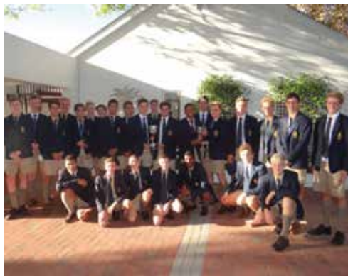
Sports Day / Heats Week Winners (shared)