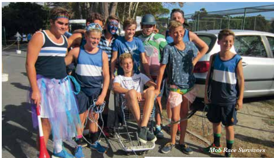
Mob Race Survivors