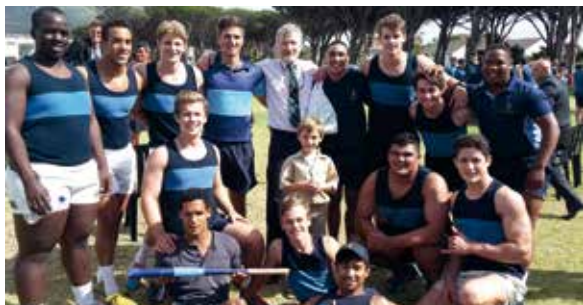
Inter House tug-of-war champions