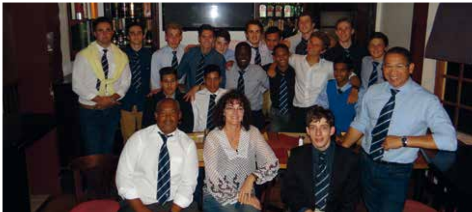
Matric Dinner at Nelson's Eye