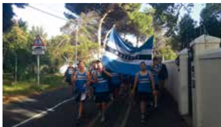
Mallett House arrives at Sports Day.

On the humanitarian side of things, Mallett revived its annual Easter Egg Drive and collected a record number of easter eggs which a number of boys distributed at Oceanview Crèche at the beginning of the holidays. They left feeling great after seeing the smiles on the children's faces after they got a rare treat seldom seen in the area. The boys were reminded of just how privileged they are and how much of a difference something small like that can make in the lives of many. We also gathered a large amount of items for the Femmekits project that was greatly appreciated.