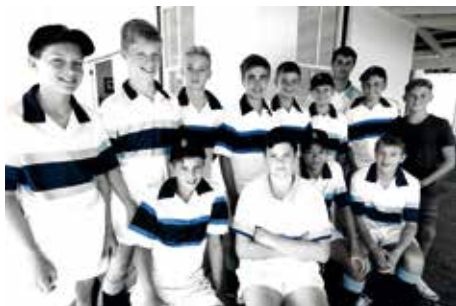
New Boy Braai