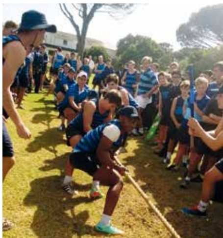
Senior White Tug of War team at work