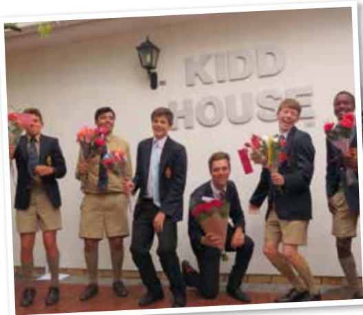
Valentine's Day Roses