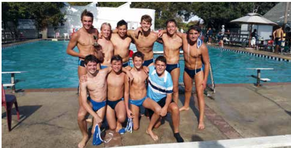
The victorious Junior Water Polo Team

ones. Early in the year the junior cricket team won their first two matches and progressed through to the finals – which will be held later this year. The seniors did not perform as well, but clearly showed great sportsmanship. The junior Mallett Waterpolo team also shone in their event as they took home first place after playing Founders House in the finals. Thus it is no surprise that we would excel in the Inter House swimming; we were able to fill all but one of the races and attained a number of podium finishes.