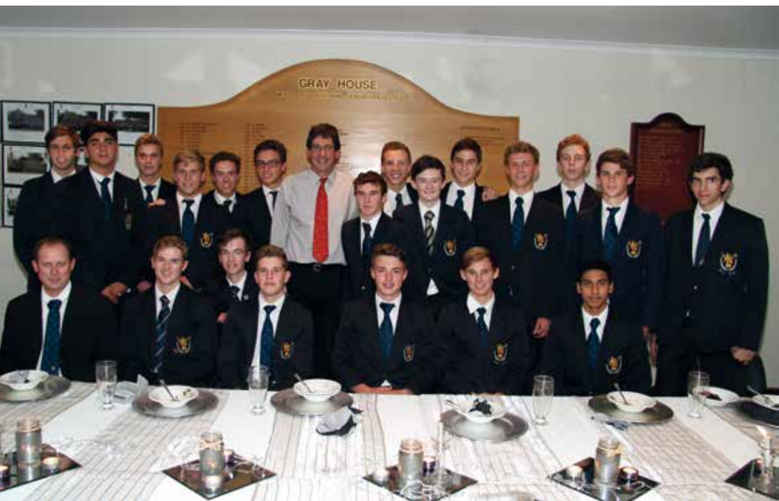
Gray Matric Dinner