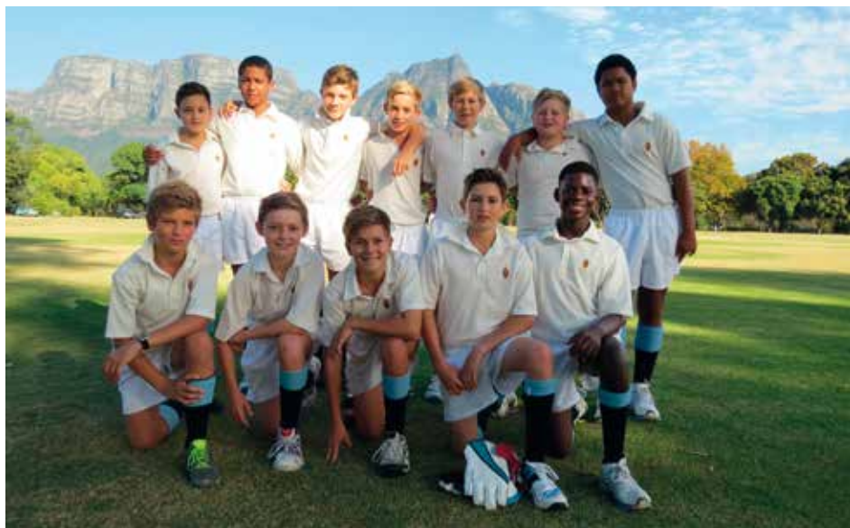
The Bishops U14B Team