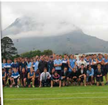
Early Morning Running