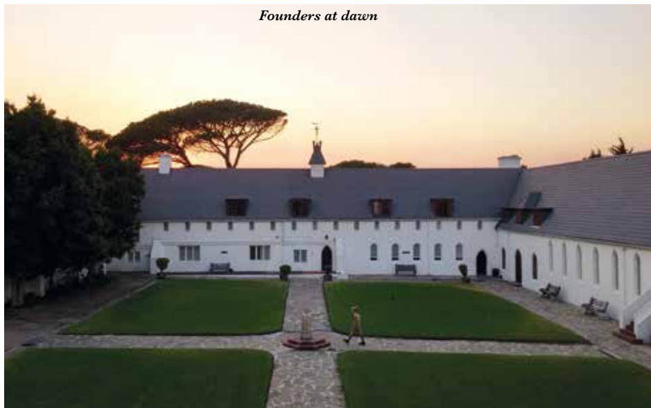
Founders at dawn