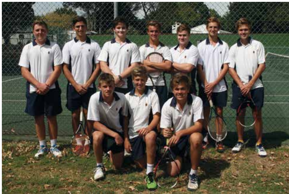
College Tennis Team 2015