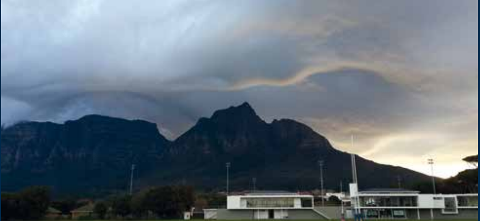
CLOUD FORMATIONS OVER WOODLANDS