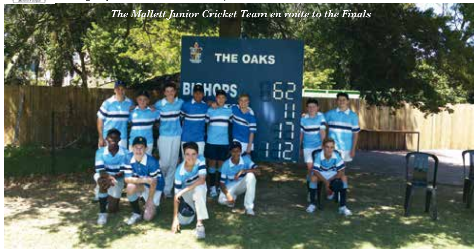
The Mallett Junior Cricket Team en route to the Finals

Mallett is a proud House whose members do their best at everything that they put their minds to and this is the number one reason that Mallett has been performing so well.