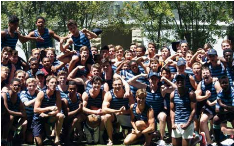
White House Spirit