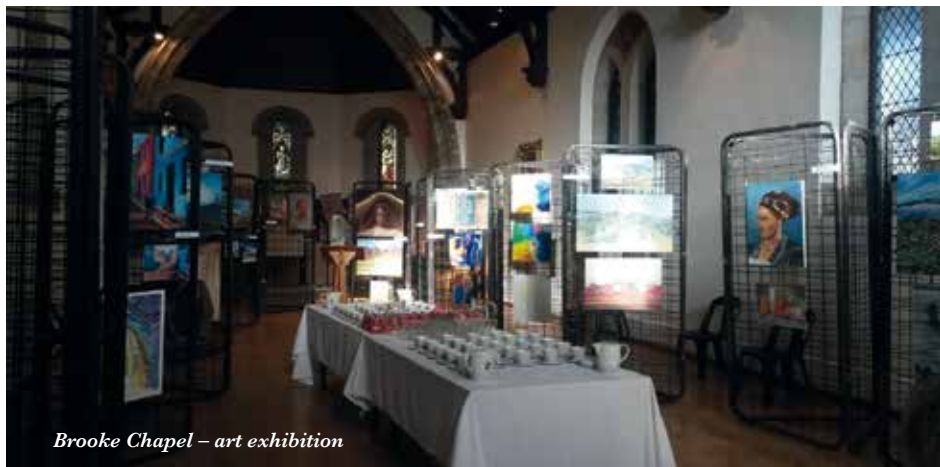
Brooke Chapel – art exhibition

Astro Turf. We pray for the challenge of good and fair competition, that we may play the ball with determination and drive and with many goals in the opposition's nets. We pray for red cards to be few and far between and give thanks for the opportunity afforded us in having use of this field. We pray, too for a blessing of this Hockey Pavilion – which it may be a beacon of sportsmanship, friendship and companionship to all who congregate here to watch and enjoy the games played. And so Heavenly Father – bless now these places in your Holy Name. Amen.”