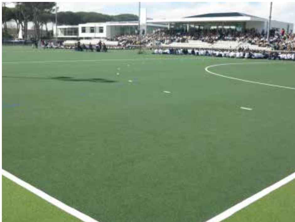
The Woodlands Astro