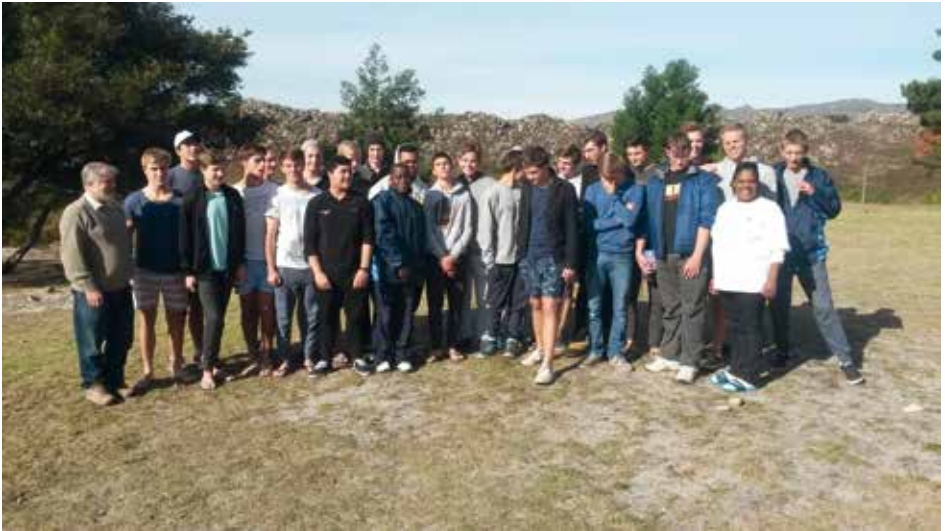
Confirmation boys on camp