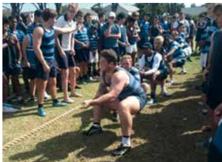
Founders Senior Tug of War