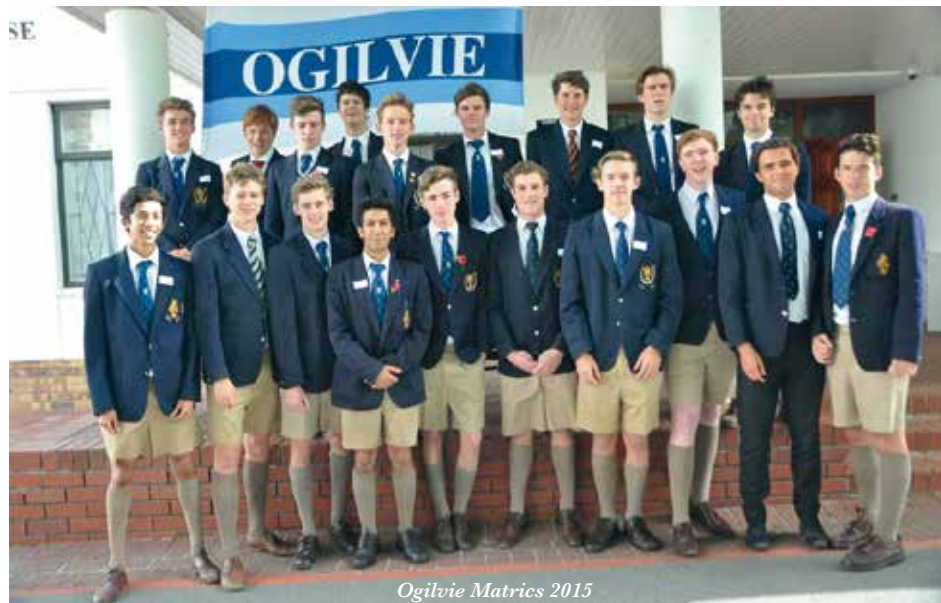
Ogilvie Matrics 2015

In addition to our performances as a group,