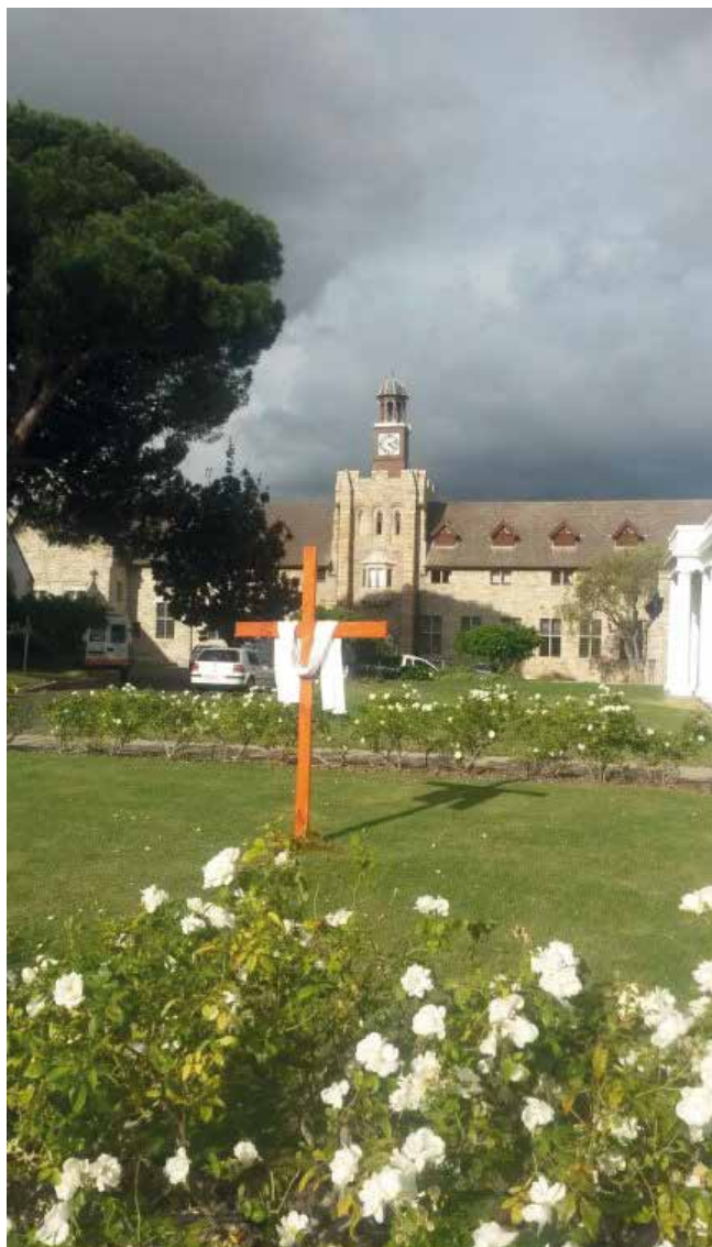
Easter Cross at Bishops

addressing the boys of the College. He left them with much to think about in terms of being good members of the communities they serve and challenged them always to keep