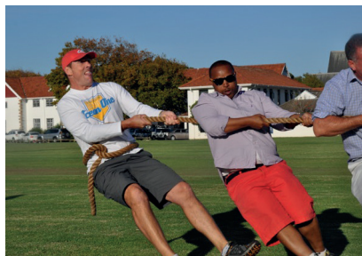
Grade 2 Dads putting their backs into the tug-of-war!