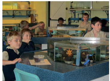
Grade 1s enjoying the lesson at the Two Oceans Aquarium.