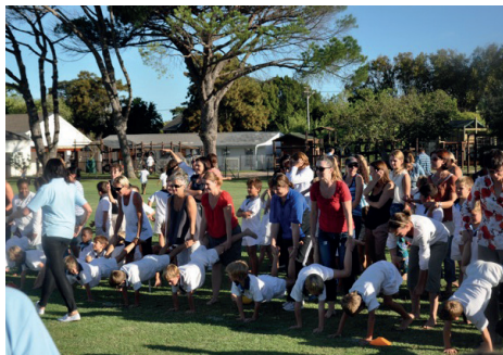
Grade 2s with their mums preparing to start the Wheel Barrow relay.