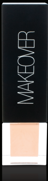
Liquid Foundation R 149.00