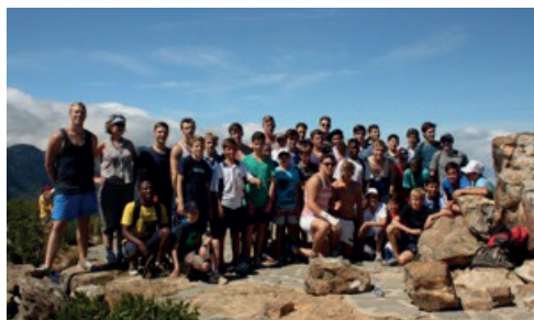
Mentor / Mentee Hike to the top of Lion's Head.

Another two crazy terms have passed in Mallett House, with many events happening and boys and staff occupied with all manner of activities! 'Eisteddfod' seems to be the word on everyone's mind, but the mid-year exams are coming up soon and one can see the stress that comes from having to balance one's life at a hectic time such as this; it is all too evident in the madness that pervades the House! The vigor and verve with which the matrices of '13 grabbed the new year was astounding, and the House has been running like clockwork over the past months! The Grade 8s have settled in well, and their varied talents and skills have been well-utilized in the various Inter House events, some individuals finding a veritable mountain of heats and/or prelims to represent Mallett in! Their involvement, passion, and dedication bodes well for the future, and their camp, hike, paintballing outing, and other bonding activities only served to showcase their grand potential.