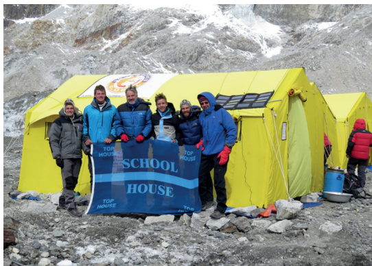
Top House conquers Base Camp, Everest!