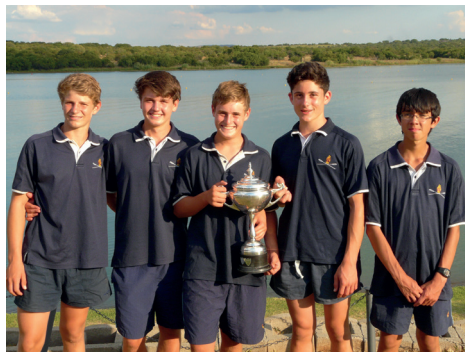
Gold Medal Winners! U15A Quad with their SA Champs trophy won at Roodeplaats Dam, Pretoria.

2013 started off with new and increased interest in rowing, with particular reference to the u14 intake. Fifteen under 14 boys came on camp in January, a significant increase on previous years. Not only did this give them the opportunity to master the basic skills of an all-new sport but the chance to integrate into the school, meeting the seniors, making new friends and becoming a part of the rowing family.