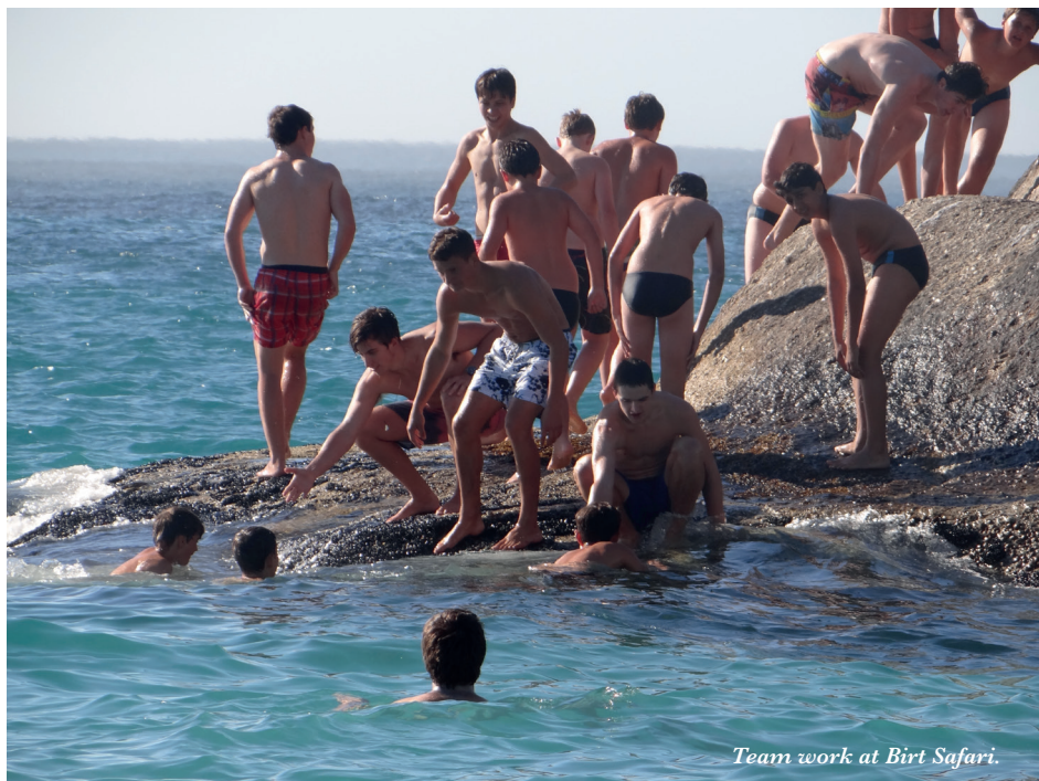
Team work at Birt Safari.