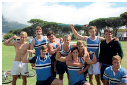
The Victorious Mallett Senior Tug-of-War team.