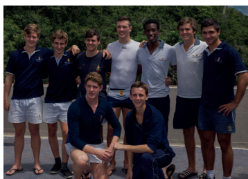
The Matric Rowers at the Buffalo Regatta, East London.