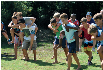
Grade 8 Camp Fun!