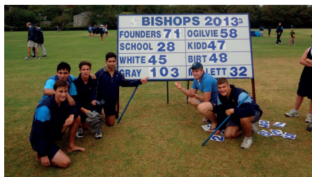
The surprise package at Sports Day!