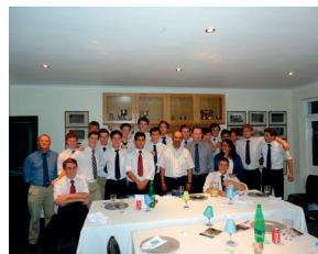
Gray House Matric Dinner.