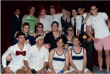
Matrics in Variety Concert mode!