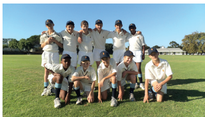
Derby-Day for the 1st time! DC vs Bosch