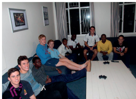
White House Matrics 2013