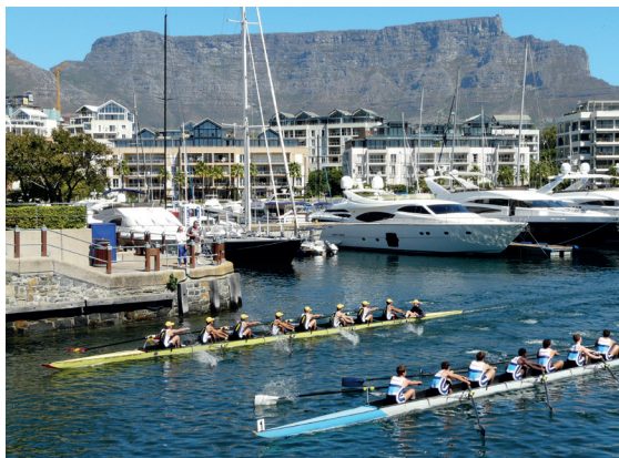
Rowing in Cape Town! Bishops Matric VIII race against Rondebosch at the Waterfront Regatta.