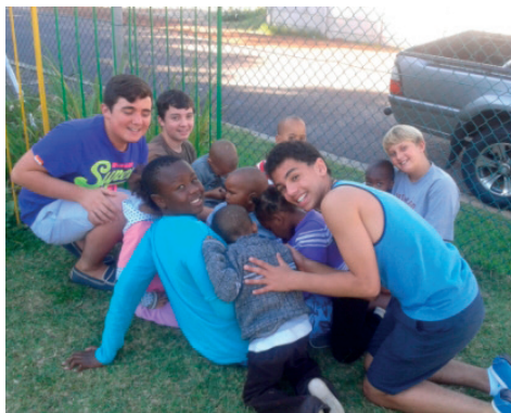
Grade 8 Community Outreach