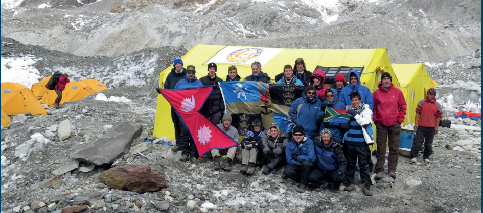
THE BISHOPS TREK TO EVEREST BASE CAMP!