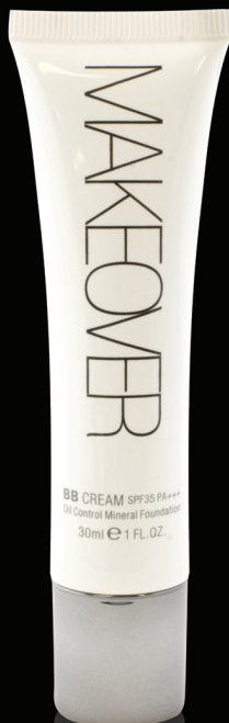
BB Cream R 139.00