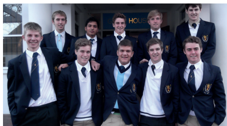
Gray House 13-year tie recipients