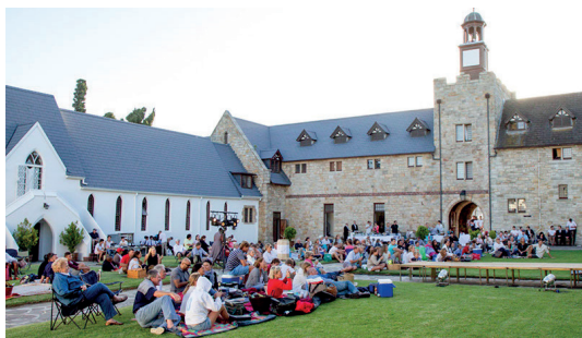
Variety Concert in the Quad