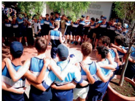
Kidd gears up for Sports Day!

The start of the year kicked off at a frenetic pace and didn't slow down until Psalm 150 was sung at the end of the 1 st term's Eucharist. I wish to compliment the House on welcoming the new Grade 8s who have settled in well and have become an integral part of Kidd. The first term was action-packed with the immediate start of early morning running; the athletics schedule and the summer sports programme which, as always, was a daunting process for our youngsters to adjust to – getting up at the crack of dawn to run around the school only then to get through the school day and have a tiring sports practice in the summer