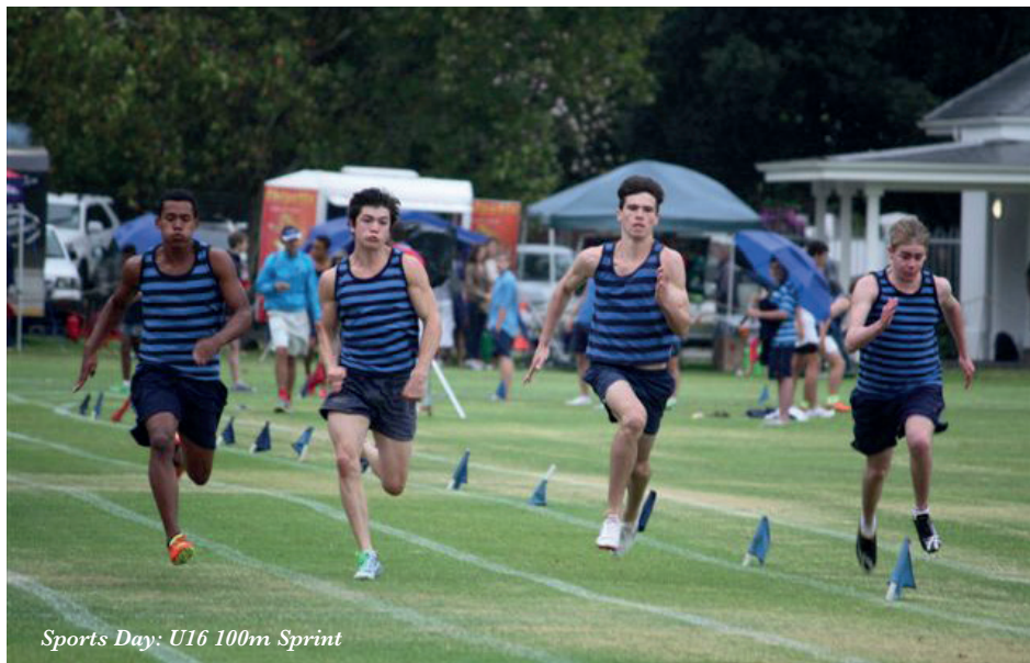
Sports Day: U16 100m Sprint