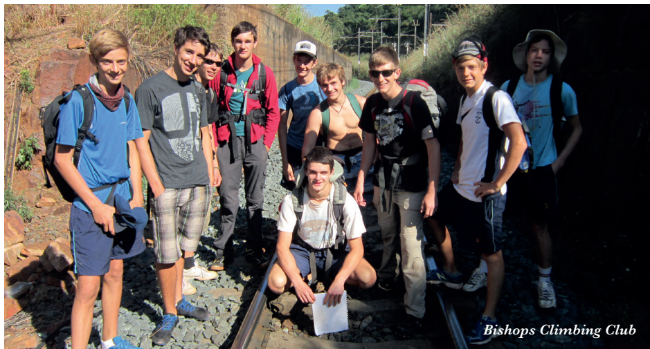
Bishops Climbing Club