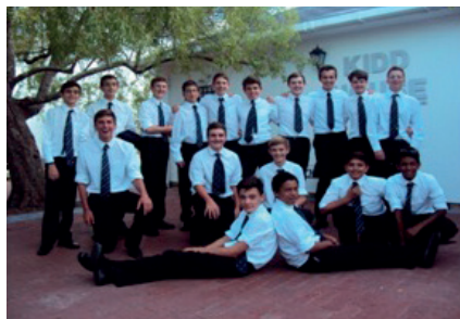
Grade 9 Dinner!

Grades 9, 10 and 12 all had their dinners last term. The Grade 9s had the standard Asian experience in the House, the Grade 10s went to the Greek Club in Greenpoint and for some of the boys it was their first time experiencing this Mediterranean cuisine. They ended the evening off with a 5-a-side football tournament which was a highly competitive affair. The Matrics ventured off to town to the Royale Eatery where they enjoyed their well-renowned hamburgers and oversized milkshakes.