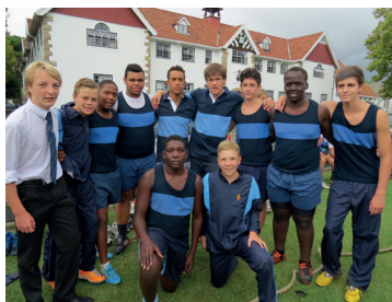
Junior tug-of-war winners.