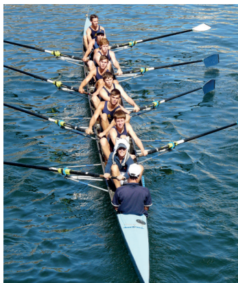
Grade 11 VIII at Waterfront Regatta.