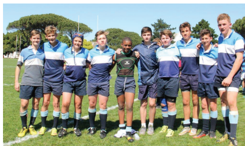
Victorious U15 Inter House Sevens Champions