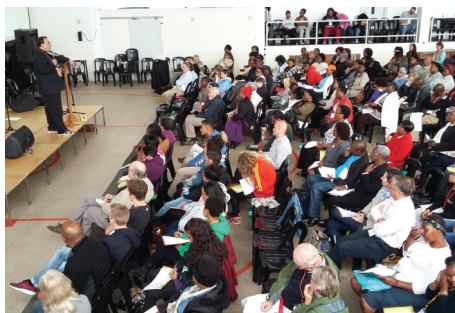
Anglicans Ablaze Conference in session

Robert Gray Day on 1 September was celebrated at Bishops with the presence of Bp. Garth Counsell, Bishop of Table Bay, visiting. He preached at the Morning Service, commemorating the day and reminding the boys of the significance of both Robert Gray Day in the Anglican calendar and of Robert Gray's contribution to the wider Anglican Church, to Bishops and to South African education in general.