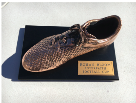
Rohan Bloom Inter-Faith Football Cup

Confirmation classes recommenced after the winter holidays and soon the Confirmation Class of 2016 was concluding their training sessions. The Archbishop enjoys the fact that the four Anglican schools of Cape Town meet together and are confirmed together at the same service. He really enjoys being with the young adults of the four schools and enjoys inviting them to Bishops court on the day before their Confirmation service. They were able to spend time with the Archbishop and his staff and to explore the question – what is it to be a Christian in a modern society? Confirmation in the Cathedral of St George the Martyr and hosted by St George's Grammar School happened on 4 September.