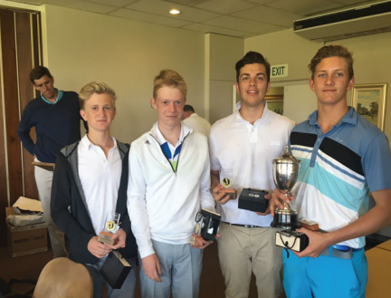
Ogilvie Golf Victors