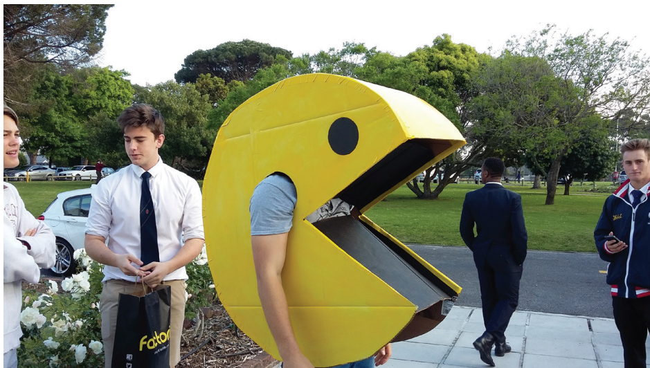
Matrics 2016 – Pacman visits Hymn Practice!

In a beautiful ceremony presided over by Archbishop Thabo Makgoba, the confirmation class of 2016 from Bishops, St Cyprians, Herschel and St George's was confirmed with great pomp and ceremony.