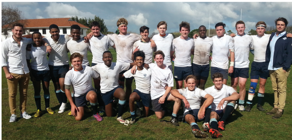
4th team after a happy home win