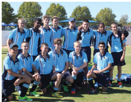
Independent School Tournament Victors