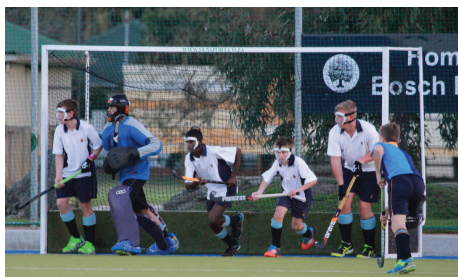
Successfully defending the goal mouth off a short corner against Bishops