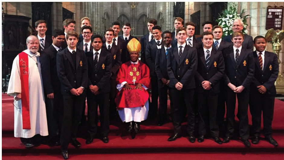
Confirmation Class 2016

Easter came and went, and was soon replaced by the blustery, rainy weather of the winter rugby/hockey season. The second term began with the prayer for the Winter Sports programme and the hope for successful learning both on and off the sports field. The Chaplain accompanied Simply Blue on their weekend away to Arniston where they were able to practise their repertoire of songs and dance for the coming season. The exams and tests soon gave way to the Eisteddfod, with singing, art, movement, drama and House singing practices echoing across the fields. Soon after the term started, the Chaplain suffered a stroke and was hospitalised. An operation to remove a brain tumour and radiation treatment for cancer followed. Most of the winter term was spent recuperating and