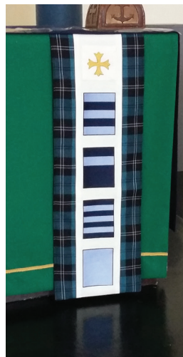
House Flags – new banners for Chapel