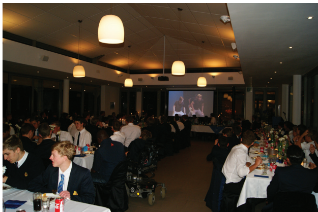
Mallett House Dinner