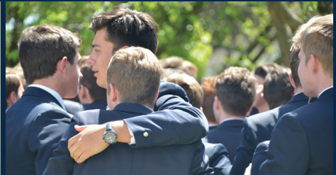
MATRIC VALEDICTORY - 2016