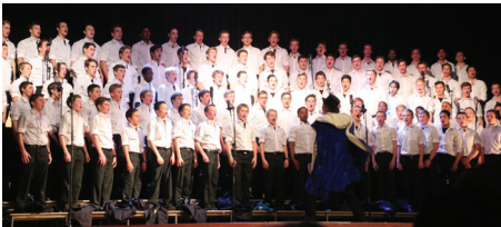
Gray House singing their way to the Eisteddfod Singing Owl