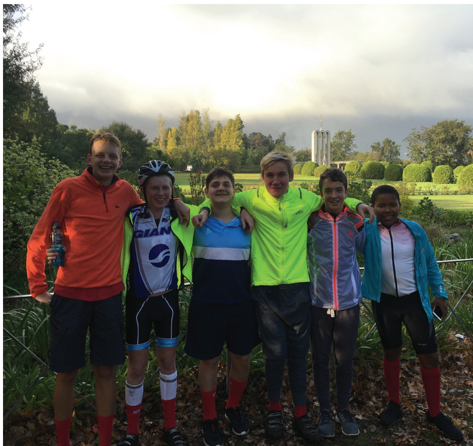
Bishops Cycling supporting the first day of the Unogwaja Challenge 2016