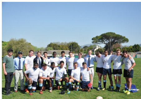
U15B team after beating Bosch

The U15Bs had a successful season. The results were mostly positive, with a few losses that could have easily gone our way. I believe this suggests that this age group has a healthy depth and that the U15A incumbents should not rest on their laurels. When the U15Bs were working as a unit, they played some marvellous rugby. I have no doubt that these young men have some stunning rugby ahead of them. The likely highlight for the season was getting the double over the old rival, fighting hard to beat Bosch home and away. I anticipate