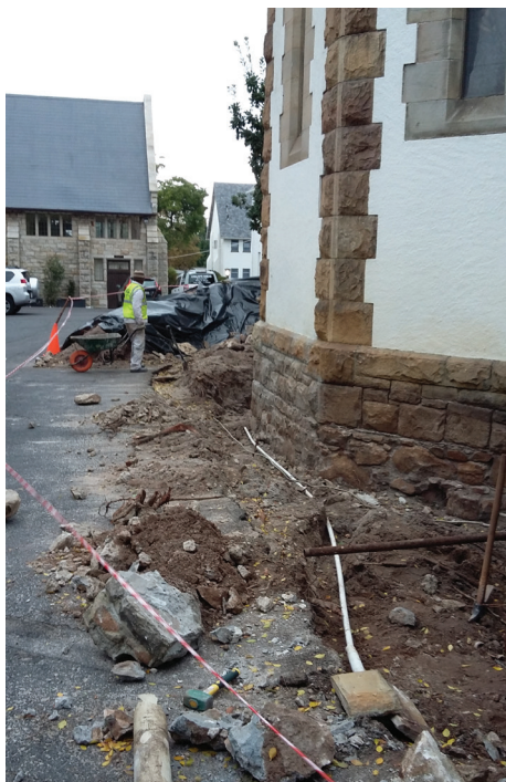
Repair work – Brooke Chapel

is the senior Anglican cleric in charge of the Anglican seminary based in Grahamstown where many Southern African Anglican clergy are trained. Her message was a strong and inspiring one that left the boys and staff with much to think about.