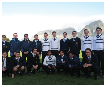
Winners of the Best House Grade for Academics: Kidd Matrics