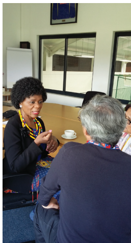
Adv. Thuli Madonsela visits Bishops for Anglicans Ablaze conference