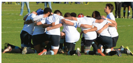
The U15A team pulling together before the Bosch game

From the outset our kind of rugby was about fifteen dedicated players who had a burning desire to win and a fierce pride in themselves and their team. The players quickly adapted to the rigours of U15 rugby as they met bigger opponents more often than not. Coaches