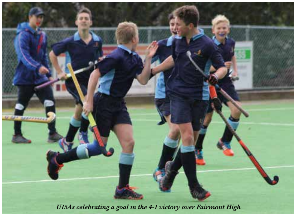
U15As celebrating a goal in the 4-1 victory over Fairmont High