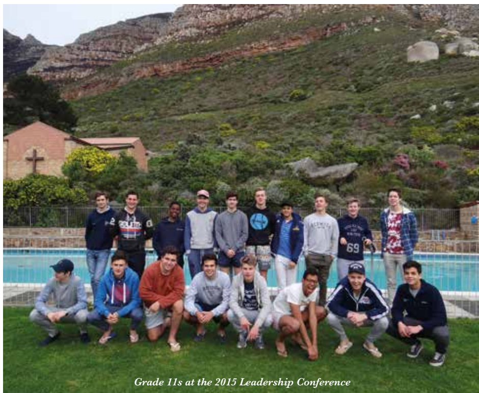
Grade 11s at the 2015 Leadership Conference