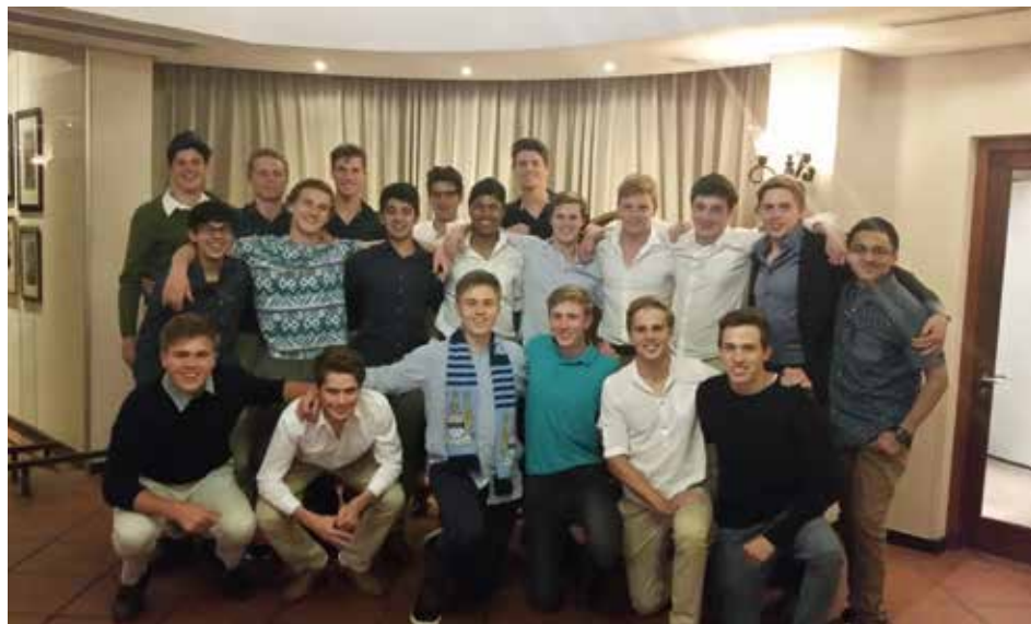
The new leadership group in Mallett House

One and a half terms have already passed since our last report and it has been an extremely busy time. The matrics are currently writing finals – we wish them all good luck; the Grade 11s are preparing for their exams and have taken over the leadership of the school, and Grade 10s are preparing for the Epic and Exchange.