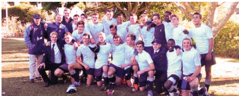
The U15A – J Blues – glory after the Grey win

depth in key positions. This depth was crucial to us this year as the early season load along with a relentless and very competitive league resulted in a high injury count during the early parts of the league season which certainly halted our progress and resulted in continuity issues. As a result, we struggled either early or in the latter stages of tough games where some results went against us. We never put out the same team once this season but I must commend the J-Blues squad players who took their opportunities and gave their all. We were very much a squad and there was undoubtedly good development in terms of individual player improvement. As an age group head coach, this is all I can ask, and is one of my main objectives set at the beginning of the season: build an age group and develop individual players and improve depth. That KPI we certainly achieved. In terms of results, beating Grey PE (top 10 age group side in the country) with a Herculean defensive display while being tactically accurate was one for the memory books. Then the 31-12 mauling of Rondebosch the first time they beat a Southern Suburbs rival at the college was undoubtedly the best attacking display we put out this year. When at full strength and with continuity