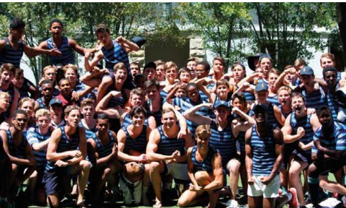
White House spirit