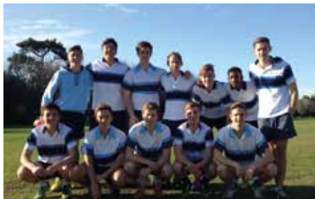
Inter House Soccer

with Ogilvie making finals for both Junior and Senior Debating. We won the Drama Owl, also winning the prize for the Best Play and Best Director. Finally, we were runners-up in most other Owls leading to our ultimate goal; we won the Eisteddfod Owl. The Eisteddfod was competed in a sportsmanlike manner by all the Houses and through the competition everyone had a fantastic time. On the back of the athletics win we could not have hoped for more!