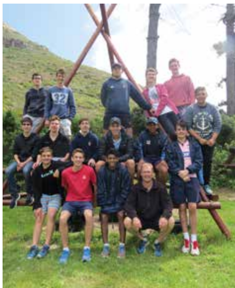
Grade 11 Leadership Camp 2015