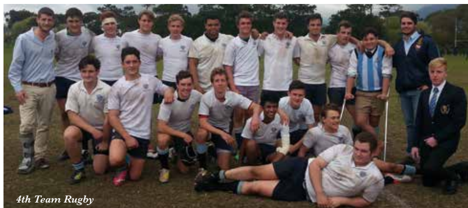
4th Team Rugby