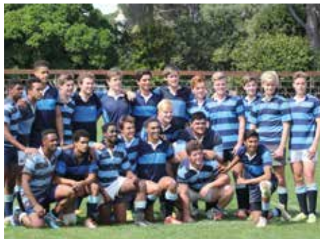
Inter House 7s: Founders vs School