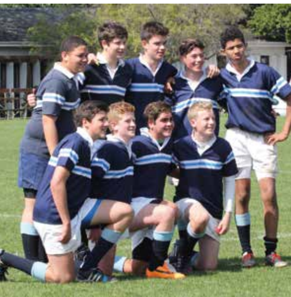
Junior Inter House Soccer Winners