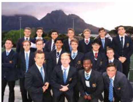
Mallett Matrics 2015

and the rest of the matric group. Sticking to tradition, after the Eisteddfod we were treated to a marvelous breakfast in the Day Boy Dining Hall for winning an Owl.