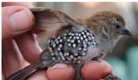
Examining a Pink Throated Twinspot before ringing it and releasing it