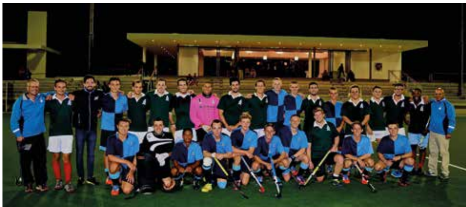
1ST XI and ODs