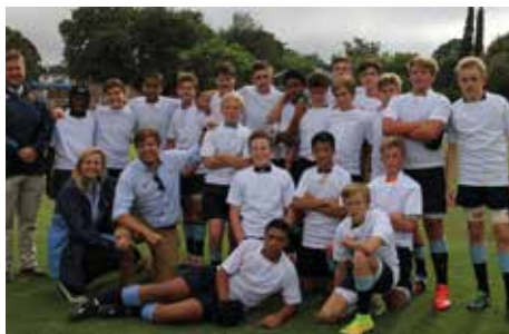
The U14 Squad just before match against Graeme College

will be remembered by the boys, their coaches and manager for many more years. The U14A squad, made up of boys from six different prep schools, started the season off on a high note, touring the hills of Grahamstown and winning both games against St Andrew's and Graeme College convincingly. We had pace out wide and so, without much fuss, the squad came together and were able to move the ball quickly through the hands allowing our wings to put away numerous tries. On our return to home turf, we faced Paarl Gim on Sahara, a difficult start to our season, but we managed to keep a brave score, only losing by 15-25. Our season scoresheet is one of few victories scattered in between narrow losses. As frustrating as this was, we persevered steadily and continued focusing on the process of upskilling and developing the boys with a view of the future of Bishops rugby culture. This became evident in our last few games, within our local derbies, in which we dominated in terms of skill and structure, and were ultimately rewarded with a memorable victory against Rondebosch. Every boy who wore the U14A rugby jersey deserves to be commended on the effort and contribution he gave to Bishops rugby over this most memorable 2015 season.