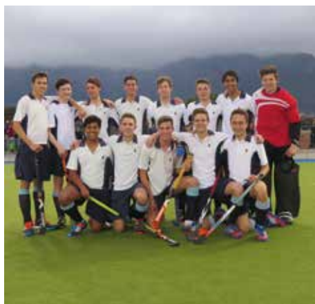
2nd XI preparing for Rondebosch in the final game of the season