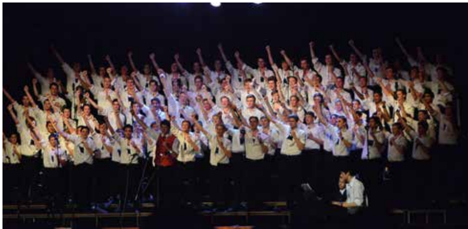
Inter House Singing