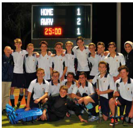
3rd XI – winners versus Rondebosch