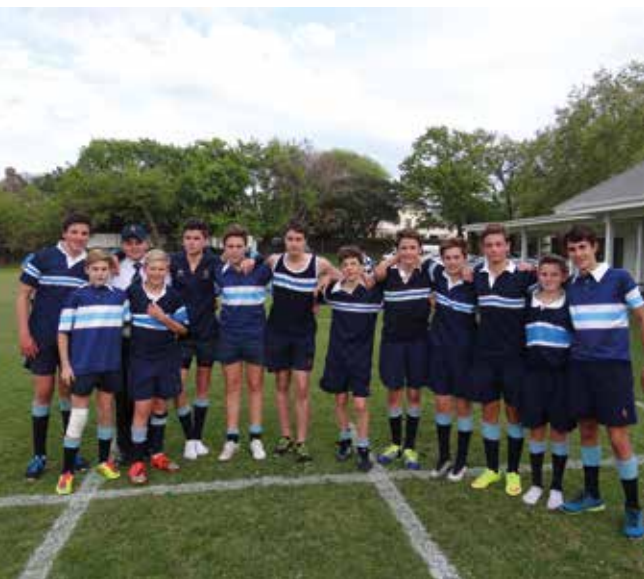
U15 Rugby 7s Champions