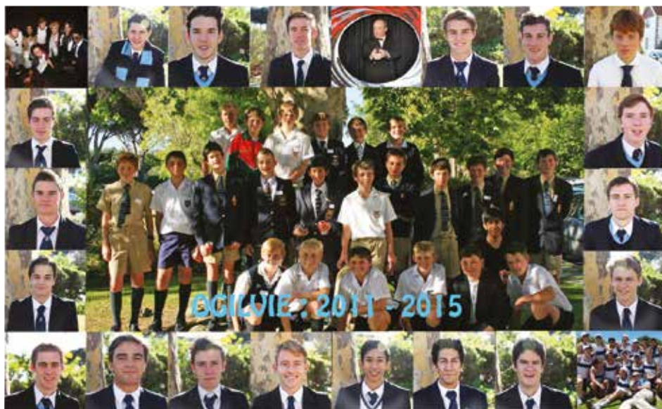
Ogilvie Matrics: 2011 – 2015