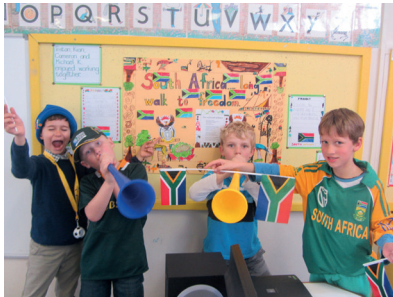
Proudly South African!

story-time with the mums and dads. In keeping with Heritage Day, we ended our term with a theme called Proudly South African. We dressed up; learnt our National Anthem; discussed our differences and similarities; shared South African foods; and did exciting art projects. It was a lovely way to end a very busy term.