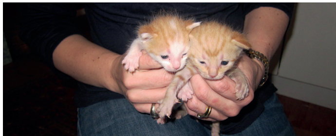
The kittens smiling at the camera - they are doing exceptionally well!