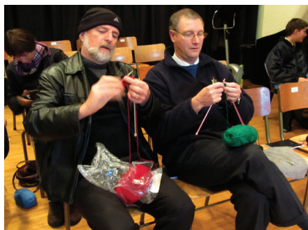
Teachers Get Knitting too!