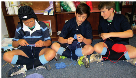
Let's get Knitting!