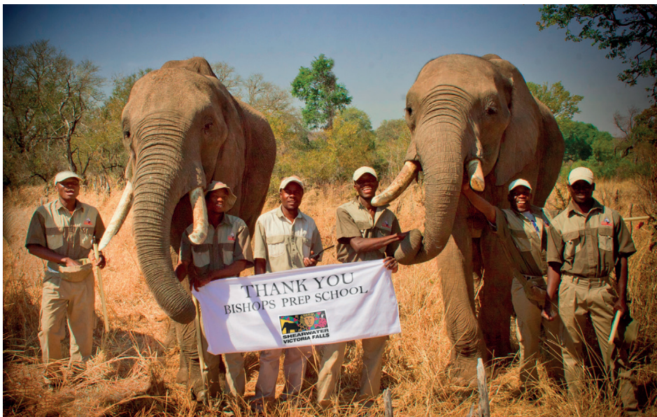
A Huge Thank You from Shearwater Victoria Falls.

What a busy, but rewarding time this has been! Besides our Read to Feed project, the Prep has been involved in a wide range of social responsibility events ranging from monetary collections to spreading sandwiches for the pupils of St Paul's Primary to knitting squares for blankets for the elderly.