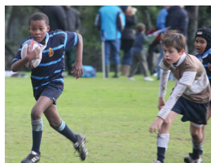
Catch me if you can!

The season started off slowly with the boys trying to adapt to 15-man rugby. There was a great deal of passion and enthusiasm which carried through the season and was one of the biggest characteristics of this team. After a slow start to the season with a tough loss, the boys fought back to get some very encouraging results – wins against Rondebosch, WPPS, Wynberg and Sweet Valley being the most notable victories. There was plenty of raw talent shown in this team with a lot of versatility displayed by the boys when played in different positions. The boys grew in confidence and skill throughout the season and this will no doubt bear fruit