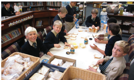
Bishops Prep makes Sarmies!