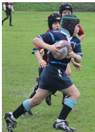
Getting round your opposition is easier than first thought.