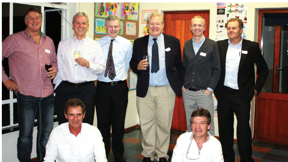
Pre-Prep Sub A class of 1962