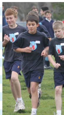
Participation is key!