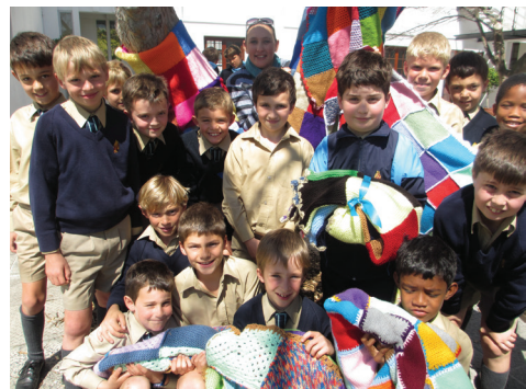
The Final Products!