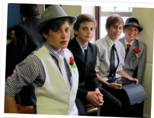
Backstage Fun at ‘Guys and Dolls’!