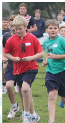
Inter House Cross Country