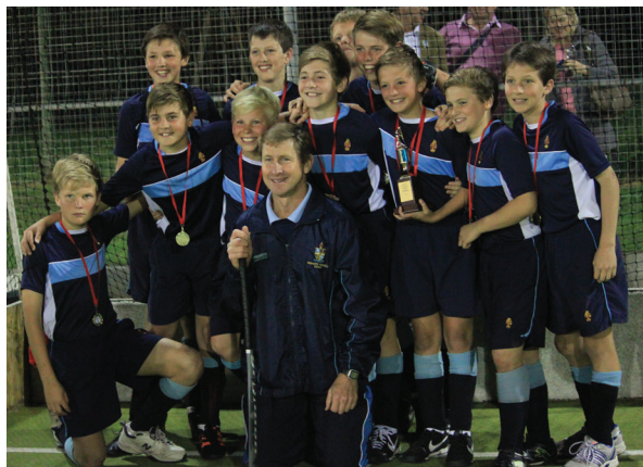
Bishops U12 Day/Night Hockey Champions.