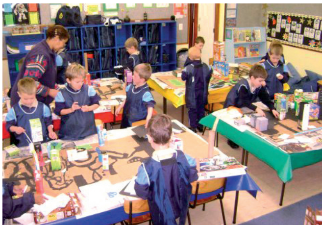
City designing is busy work!

Exploration defines the third term in the Grade R block. The security of knowing what is expected as a member of the Grade R family has given the boys the confidence to test out their skills and make new discoveries. We get so excited when they want to show us their accomplishments either outside or inside the classroom. Our themes lend themselves well to the boys' desire for reaching new frontiers. New learning was to be found from the depths of the ocean to the infinite realms of our galaxy. It has been an inspirational term! We started the term with the familiar. Our young gentlemen had fun practising their communication skills; pretending to be town planners designing