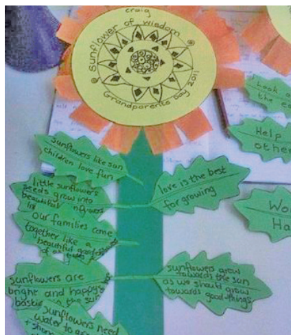
Right: Seeds of Knowledge shared by Grandparents