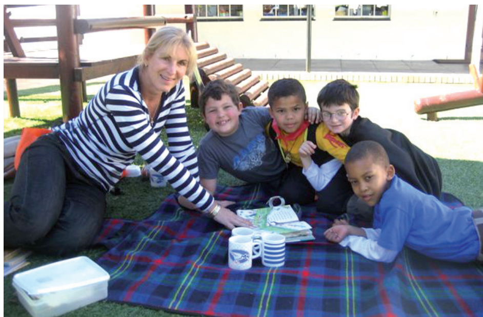
Grade 1s enjoying story time with some mums during our Readathon Week